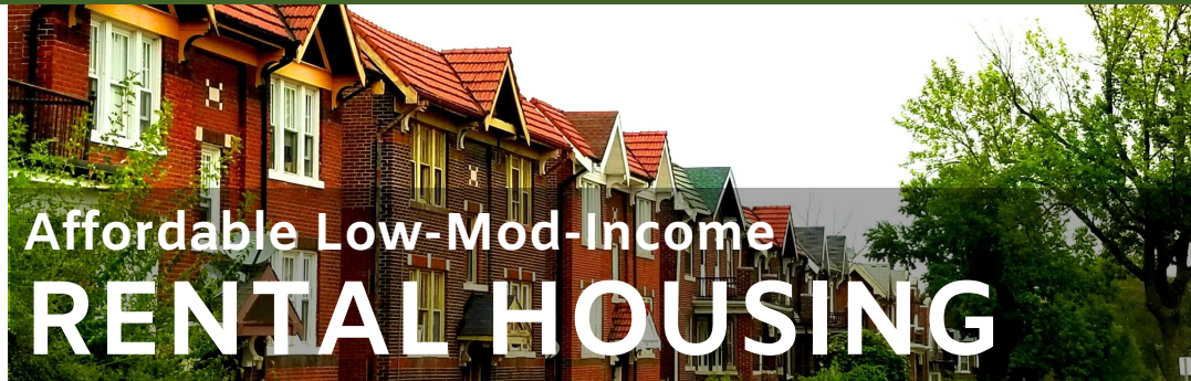
Affordable Low-Mod-Income RENTAL HOUSING