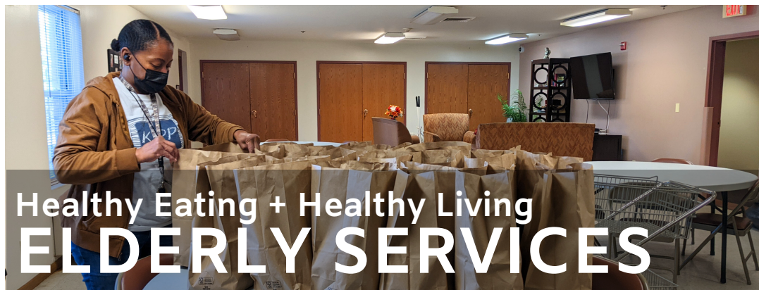
Healthy Eating + Healthy Living ELDERLY SERVICES