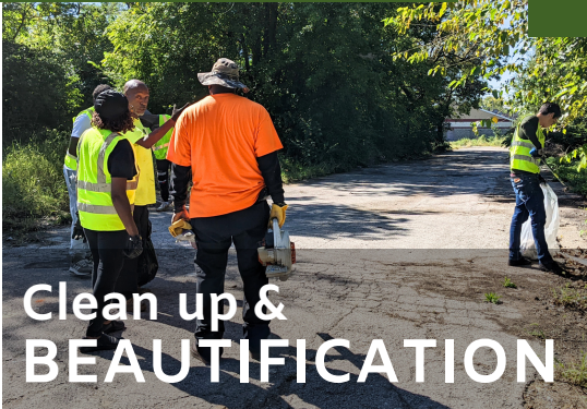
Clean up & BEAUTIFICATION

Service Area: Baden, Carr Square, Fairground, Fountain Park, Gate District, Greater Ville, Hamilton Heights, Hyde Park, JeffVanderLou, Kingsway East, Kingsway West, Lewis Place, Mark Twain, Mark Twain/I-70 Industrial Park, North Pointe, O'Fallon, Old North St. Louis, Penrose, St. Louis Place, The Ville, Vandeventer, Walnut Park West, and Wells-Goodfellow.