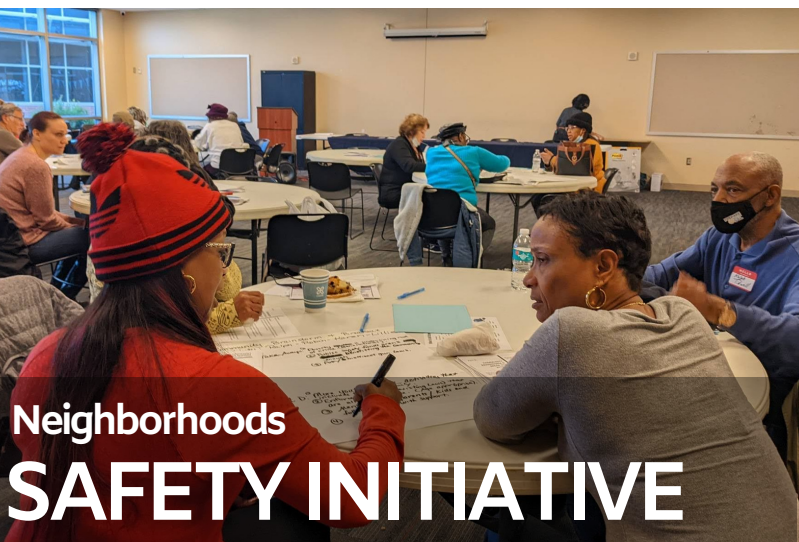
Neighborhoods SAFETY INITIATIVE