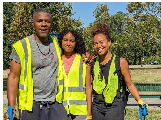
In partnership with the Young Friends of earthday365 and Missouri Department of Conservation, NNA hosted another successful bi-annual clean up at O'Fallon Park.