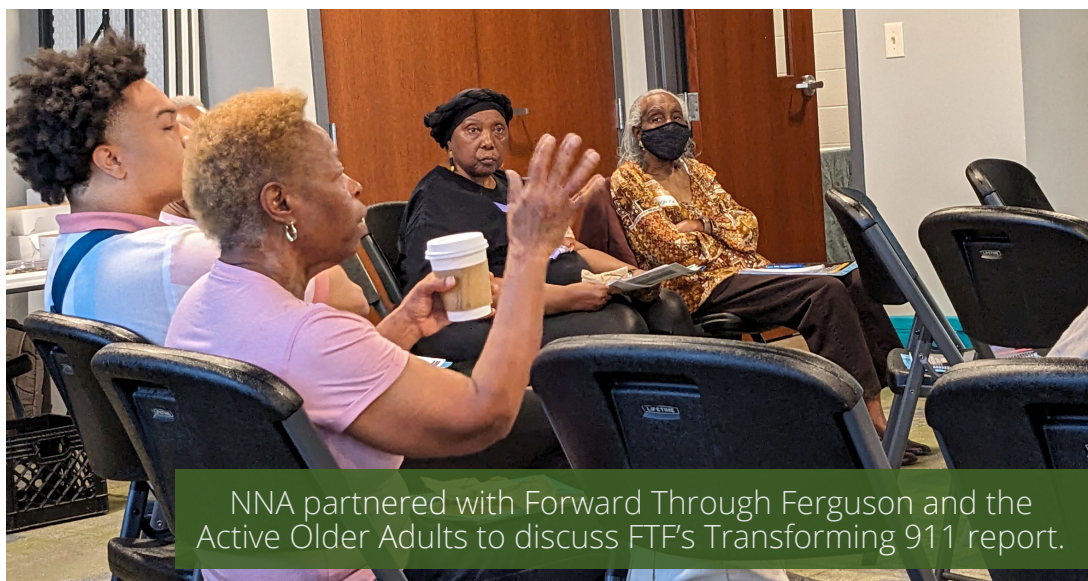
NNA partnered with Forward Through Ferguson and the Active Older Adults to discuss FTF's Transforming 911 report.