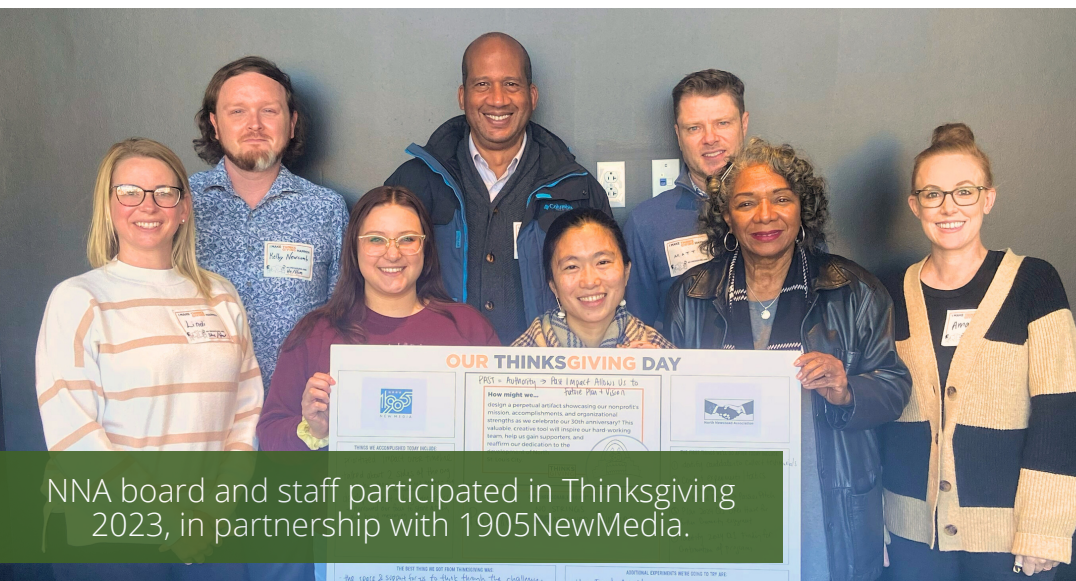
NNA board and staff participated in Thinksgiving 2023, in partnership with 1905NewMedia.