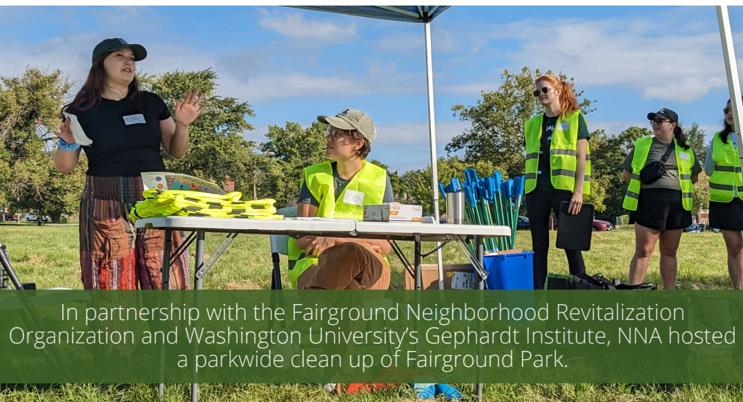
In partnership with the Fairground Neighborhood Revitalization Organization and Washington University's Gephardt Institute, NNA hosted a parkwide clean up of Fairground Park.