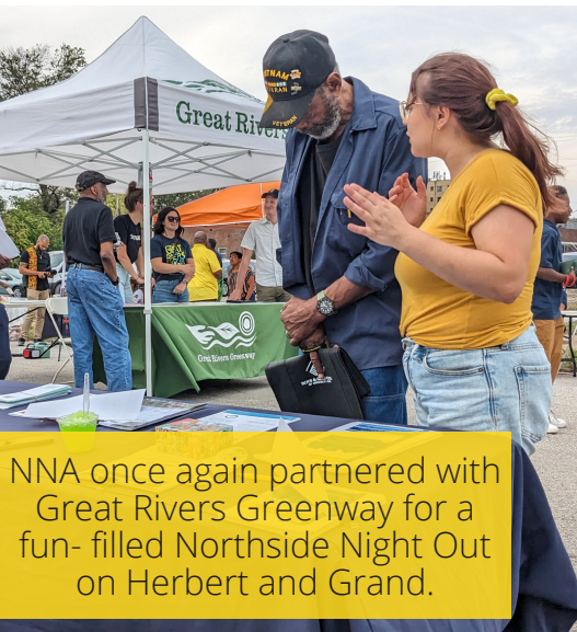
NNA once again partnered with Great Rivers Greenway for a fun-filled Northside Night Out on Herbert and Grand.