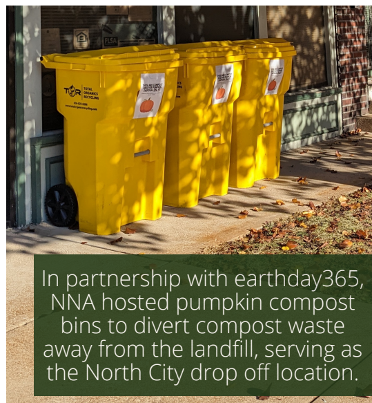
In partnership with earthday365, NNA hosted pumpkin compost bins to divert compost waste away from the landfill, serving as the North City drop off location.